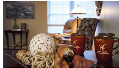
Household renovation at Park Centre

The program also assures residents that if they need care at some point, they will be able to access it immediately from WesleyLife at no cost other than their membership and monthly fees.