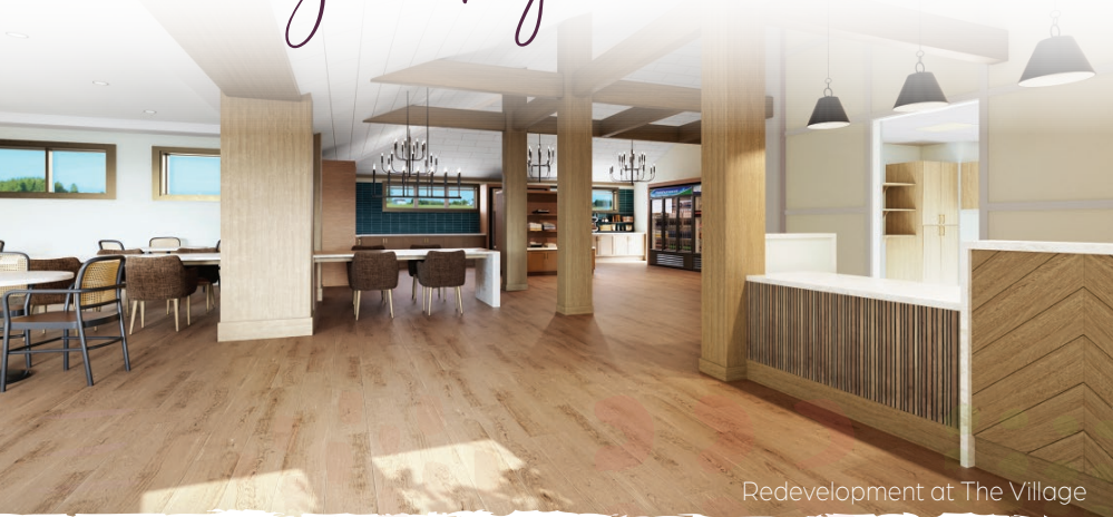
Redevelopment at The Village

As we move through our 78th year, WesleyLife continues to illustrate our reach-broadening mindset with a period of unprecedented growth and development!