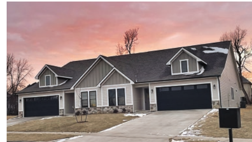
Neighborhood 19 at Brio