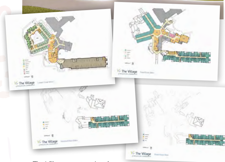
The Village master planning