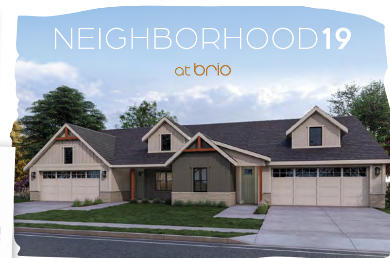
Rendering of a completed Neighborhood 19 home